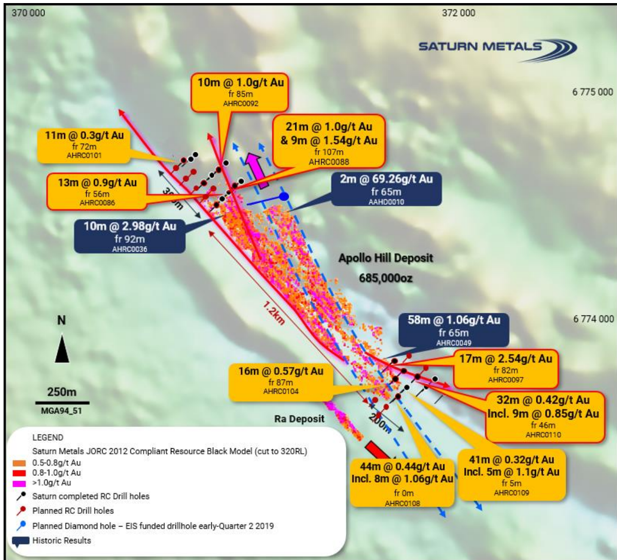
Figure 1 RC drill results relative to the published resource. Drilling results have expanded the 1.2km long mineralised system by an additional 500m strike length. Magnetic data collected in 2018 is providing a new targeting tool for future drilling. 2 Drilling results depicted originally reported in fuller context in Saturn Metals Limited ASX Announcements, Quarterly Reports and Prospectus - as published on the Company's website. Saturn Metals Limited confirms that it is not aware of any new information or data that materially affects the information on results noted.