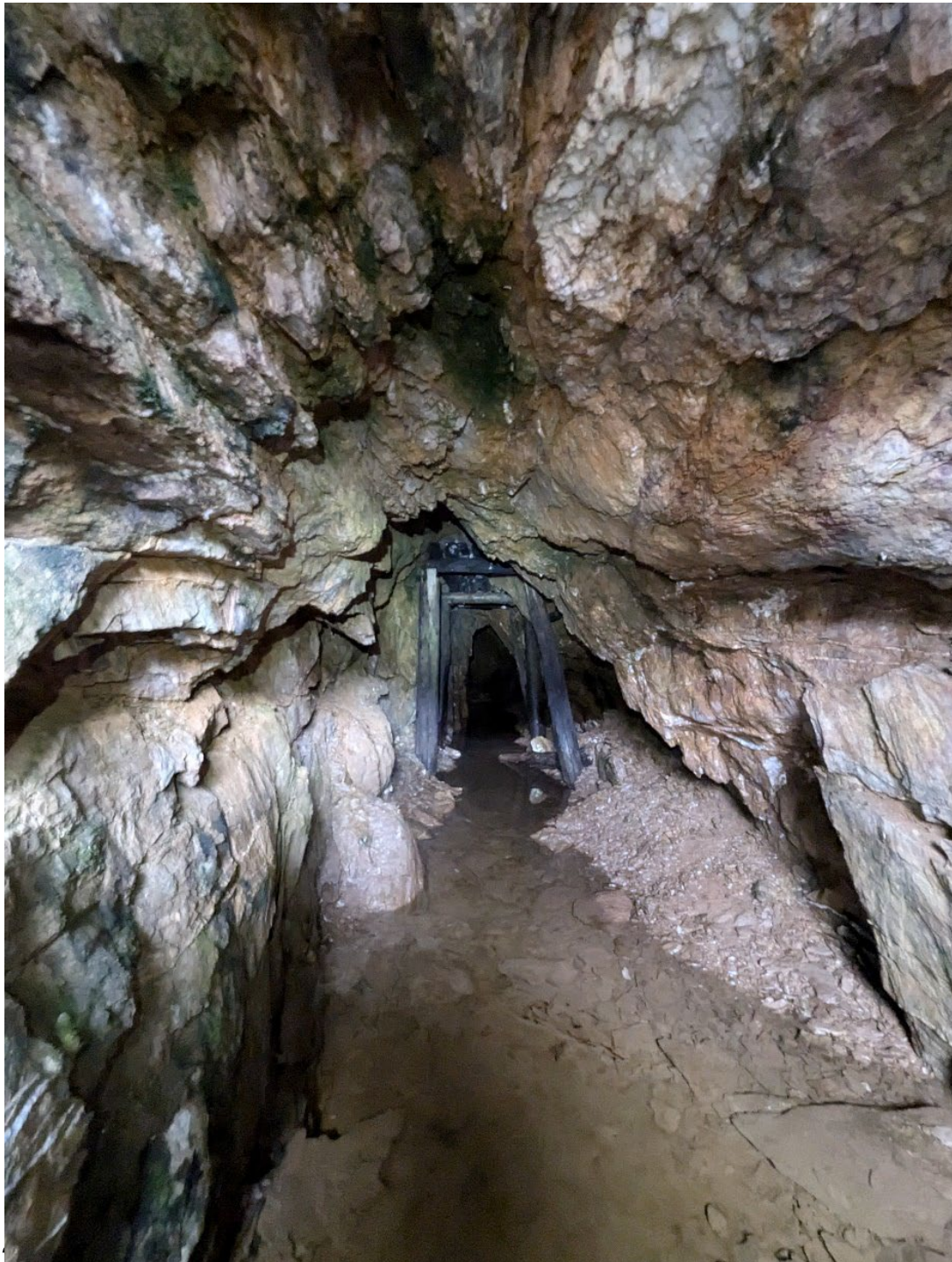
Figure 7: Inside entrance to Old Antimony mine adit 1