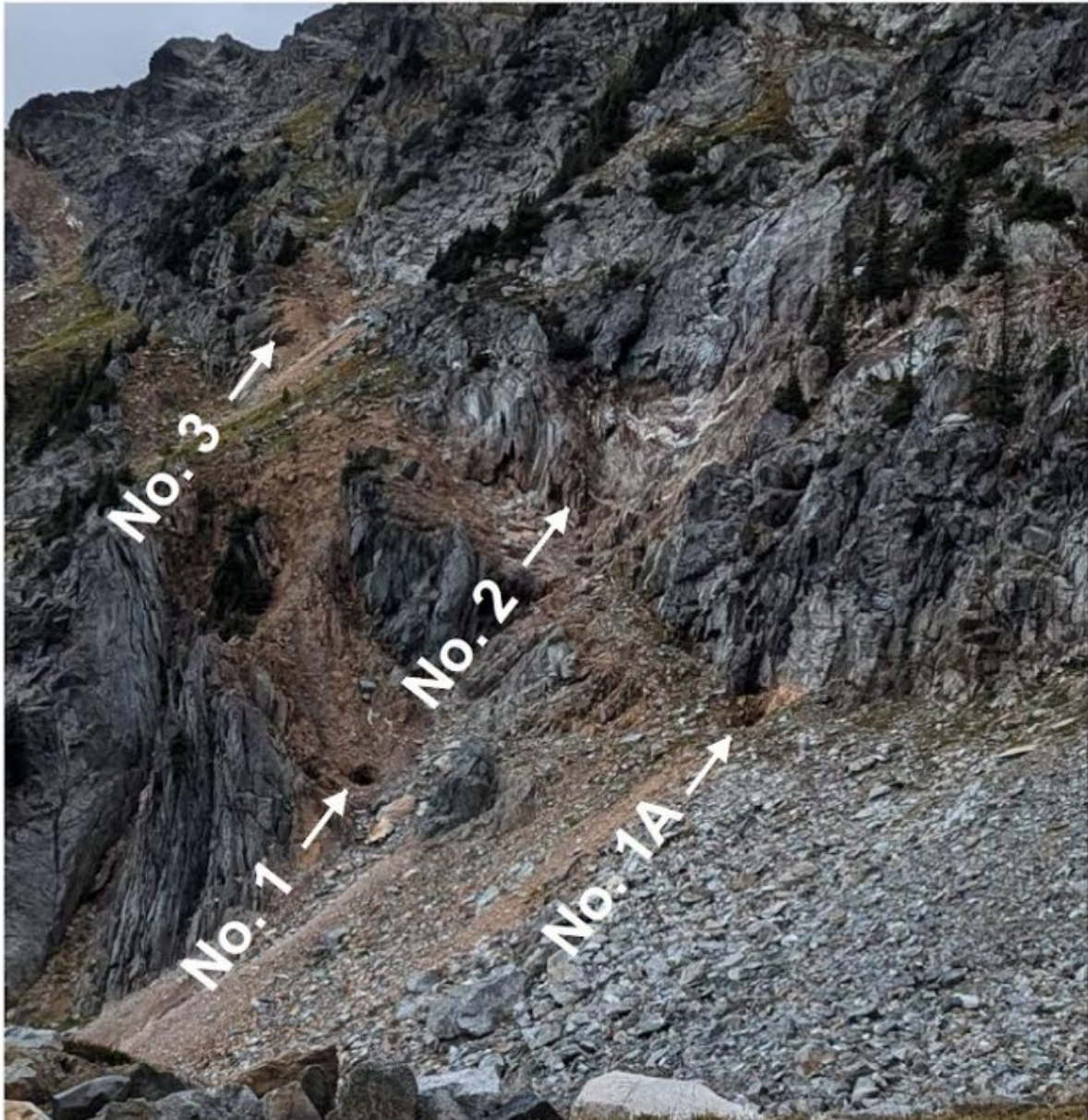
Figure 8: Locations of the old Antimony mine adits