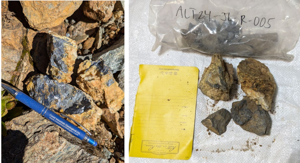
Figure 4: Massive stibnite (90-100%) in subcrop shear zone associated with quartz. Shear is steeply dipping and striking east-west, with cm-scale stibnite pieces visible.

Detailed mapping and sampling efforts along the shear zone revealed several key geological features. In the eastern extension, mafic to ultramafic rocks were identified, exhibiting varying degrees of alteration. In the more intensely altered sections, iron carbonate and talc were abundant, indicating strong hydrothermal activity. These altered zones were accompanied by a network of quartz veins, showing intricate textures such as drusy surfaces and cockscomb intergrowths, which suggest active fluid flow during the mineralising event. Occasional occurrences of euhedral pyrite crystals and aggregates were found within the quartz veins, further pointing to the mineralisation potential within this shear system.