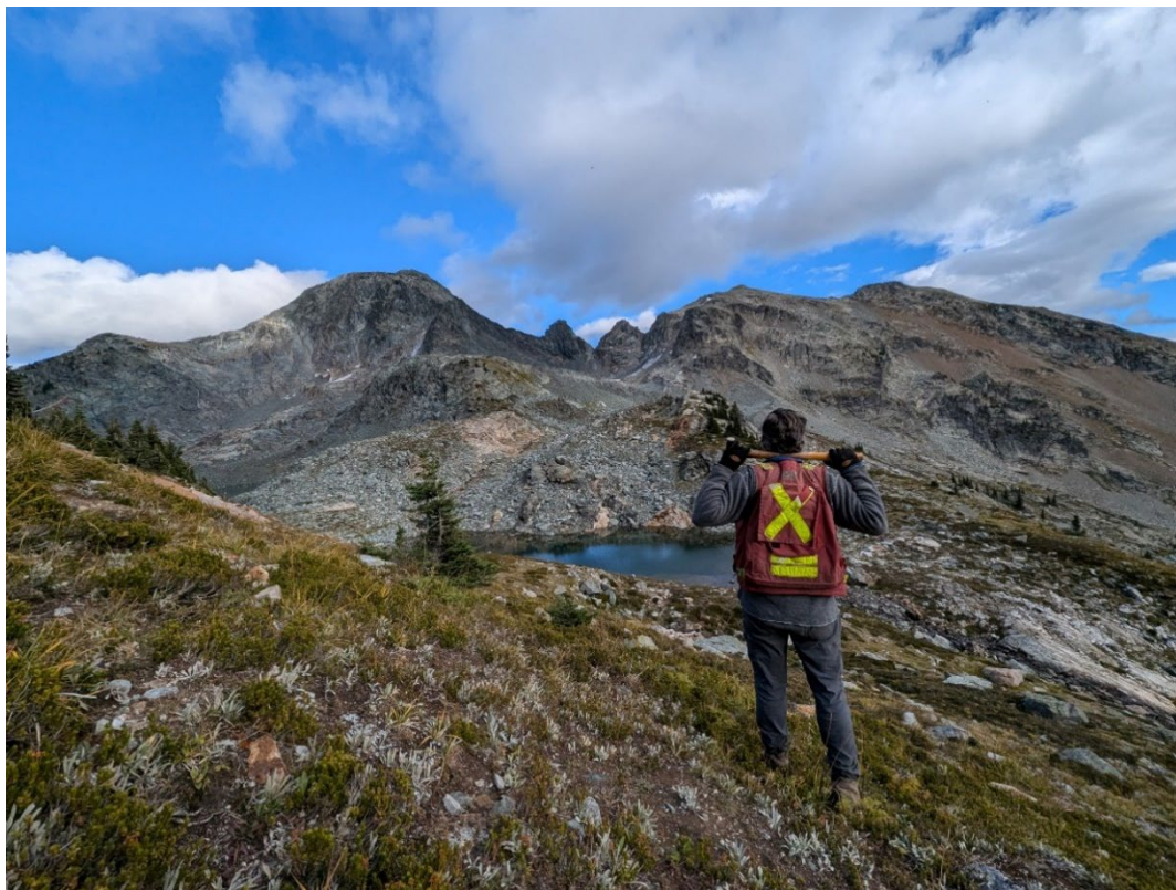
Figure 10: Prospecting eastern extent of shear zone looking east