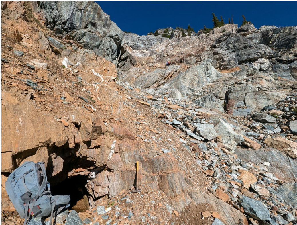
Figure 9: View from adit 1 looking north