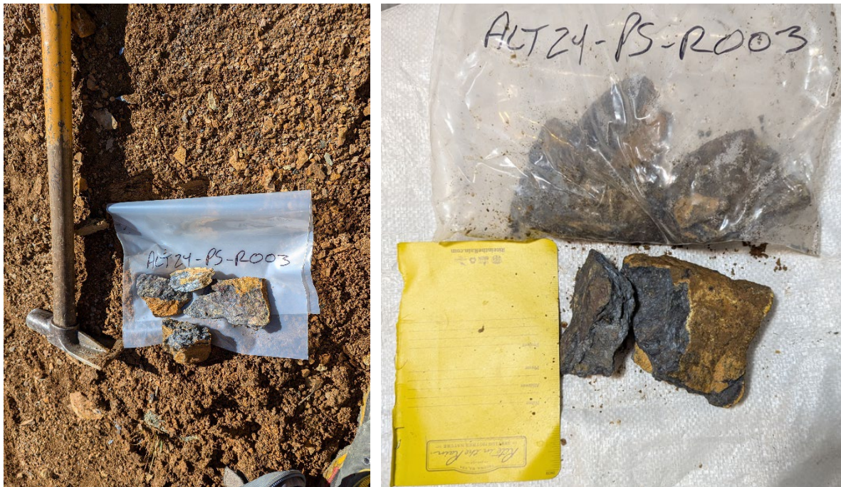
Figure 2: Subcrop sample of massive to platey silver-grey stibnite (90%) with orange-brown staining. Limited quartz (<3%) is present, with fine to coarse graining and minor quartz vugs. This sample is representative of strong mineralisation along the shear zone.

'Visual estimates of mineral abundance should never be considered a proxy or substitute for laboratory analyses where concentrations or grades are the factor of principal economic interest. Visual estimates also potentially provide no information regarding impurities or deleterious physical properties relevant to valuations.'