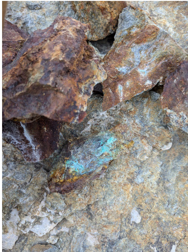
Figure 6: Malachite staining observed in an altered mafic intrusive boulder, hosting 2-3% fine sulphides (pyrite with rare chalcopyrite). Copper content is estimated between 0.5% and 1.5% based on visible mineralisation.

In addition to these recent findings, the campaign verified the historical workings of the Alps-Alturas Mine, which reportedly produced 105 tonnes of high-grade antimony ore (averaging 57.2% Sb) between 1915 and 1926. The exploration team confirmed the presence of four historical adits and a large open cut along the primary shear zone. These workings host massive stibnite mineralisation, with some samples grading up to 100% stibnite, while others displayed slightly lower percentages but highlighted the potential to expand the mineralised boundaries.