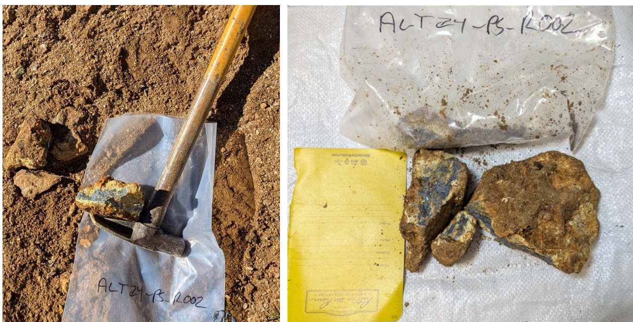
Figure 3: 5 m NW of "cut ledge", float in cut material showing moderate yellow to orange limonitic staining. Silver-grey massive stibnite (55%) hosted in a massive milky quartz vein.