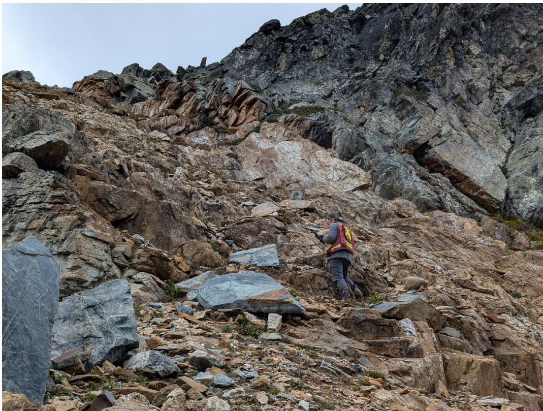
Figure 1: Mapping Eastern Shear Zone showing dilated zone up to 20 m wide

One of the key findings from this campaign was the successful identification of an extensive 1.5 km shear zone, which transects the property from west to east. This shear zone, ranging in width from 5 to 25 metres, acts as the main structural feature controlling mineralisation across the project area. The zone features multiple dilation zones, which are crucial as they provide ideal conditions for the accumulation of mineralising fluids. These dilation zones were evident throughout the structure, adding significant exploration upside. The complex geology surrounding the shear zone, characterised by rugged and steep terrain, presents both challenges and opportunities for further exploration but underscores the strength and persistence of the mineralised system.