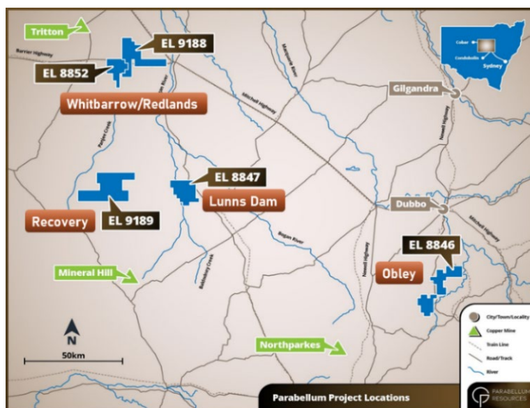
Map 1: PBL Project Location

The Company's NSW Projects comprise the Redlands/Whitbarrow, Recovery and Lunns Dam Projects in the Tottenham-Girilambone district - four granted exploration licenses covering approx. 690km 2 - and the Obley Project in the Yeoval district - one granted exploration license covering approx. 180km 2 (Map 1).