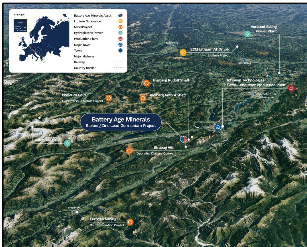
Figure 2: Bleiberg Zinc Lead Germanium Project located in the state of Carinthia, Austria.