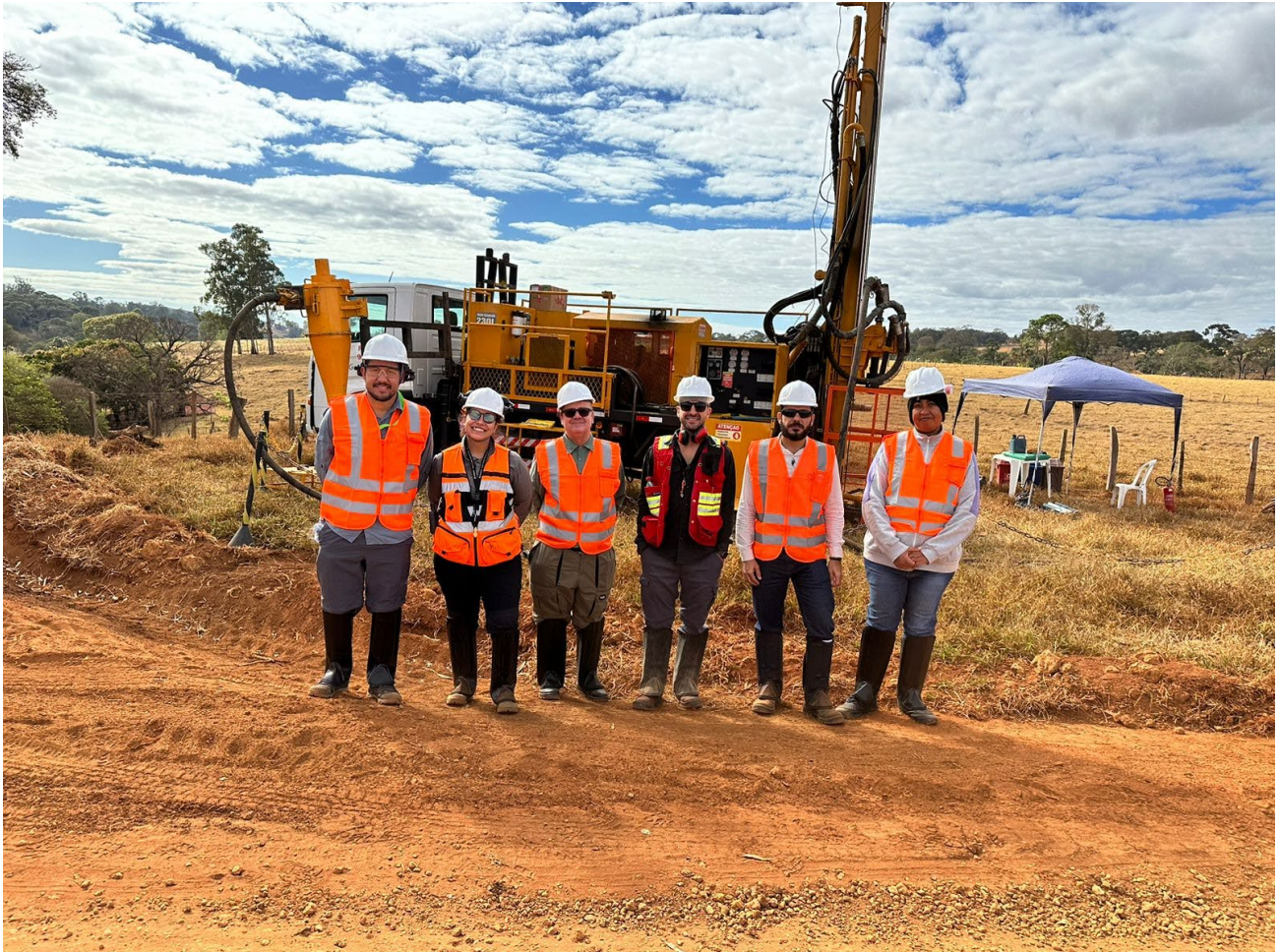
Figure 1. Equinox Resources Mata da Corda Exploration Team commencing the first RC hole at Mata da Corda