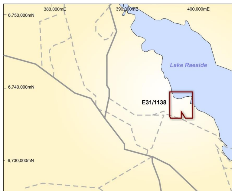
Figure 1: Dingo Project Location

In March 2017, Blina acquired the Dingo Gold Project, Exploration License (EL) 31/1138, located approximately 160km north-north-east of Kalgoorlie, and to the east of Yerilla and west of Mt Remarkable in the Eastern Goldfields region of Western Australia. The project of about 13 square kilometres covers the McAuliffe Well Syenite where surficial gold mineralisation has been identified in the regolith above the syenite. Little is known about the gold mineralisation and Blina has initiated field-based programmes to investigate and test the style, extent and tenor of gold mineralisation.