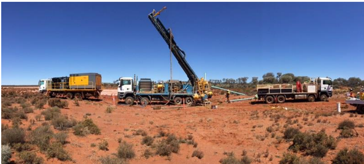
Figure 1 RC Drilling 800m along strike to the north of the Apollo Hill resource area – October 2018.