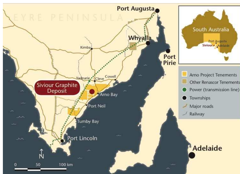
Figure 1. Siviour Graphite Project