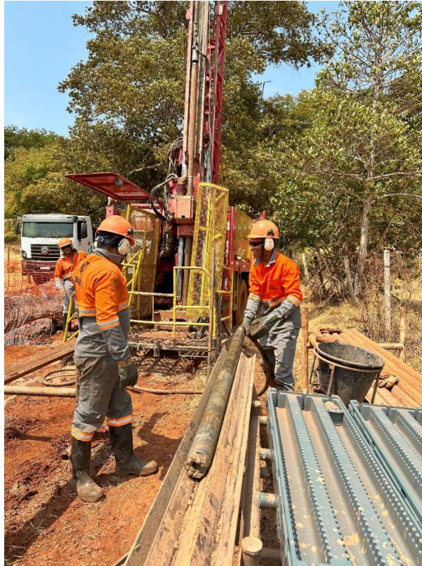
Figure 2: Diamond Drill Rig in Operation