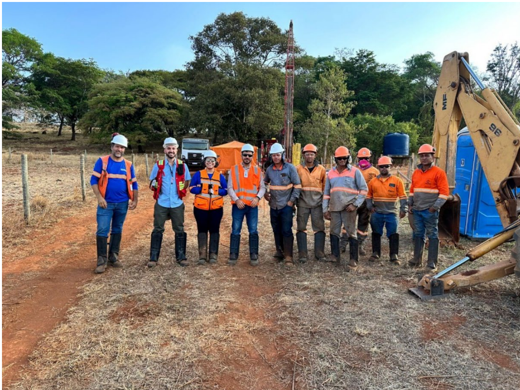
Figure 3: EQN Exploration Team Commencing the Maiden Diamond Drill Hole