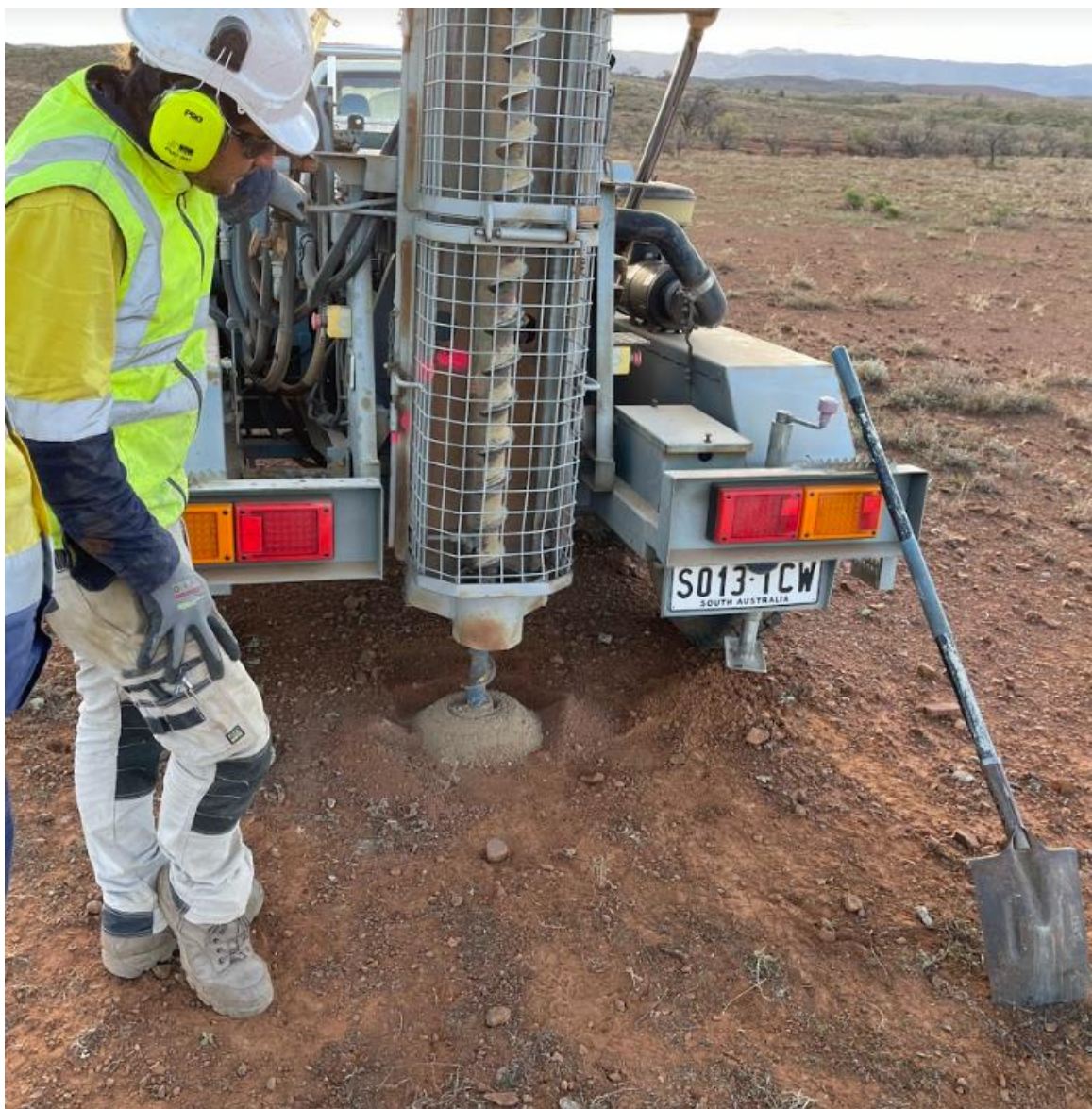
Figure 2. Auger drill spoils ready for sampling. Note the auger has obtained a sample of the green-grey coloured weathered bedrock underneath the red cover scree.

Taruga CEO, Thomas Line commented: "This auger program will provide geochemical profiles of the soil and regolith over targets concealed by shallow cover. The auger can drill down to approximately 14m, meaning that we can obtain indicators of clay-hosted REE deposits as well as concealed copper mineralisation that can't be seen from the surface. The targets we have identified are comprised of previously unknown anomalies, discovered by our team, and the ground in these areas has never before been drilled. We have applied our own concepts and new data to build these new targets and prioritise them. The auger results will assist in guiding RC drilling set to commence in July, during which we will be testing more targets than we ever have before at Mt Craig. The $650k of State Government funding awarded recently has supercharged our exploration budget, and allowed us to accelerate the systematic targeting of new prospects at Mt Craig."