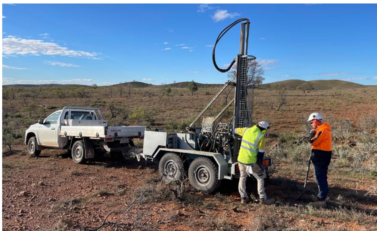
Figure 1. The GEMCO trailer mounted auger in action at Wyacca over new structural target zones covered by shallow cover and scree.