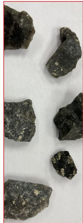
Figure 2 YBRC 069 (89 to 179m) Wide Felsic Quartz Porphyry zone hosting quartz veining and abundant sulphides

The MMI anomalies in the Discovery Zone, located up to 400m to the west of the Yidby Road Gold Deposit, represent an entirely new SUREFIRE gold discovery that significantly expands the footprint of the Yidby Gold Project.