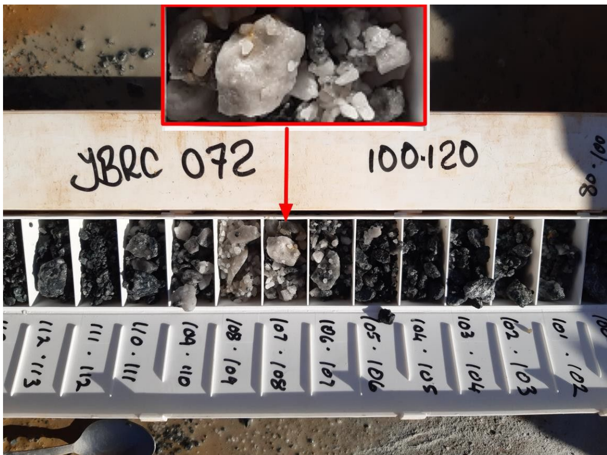
Figure 1 Interesting Quartz veining in drill hole YBRC 072

Unexpected Quartzose Felsic Porphyry, Wide (90m) & Rich in Sulphides