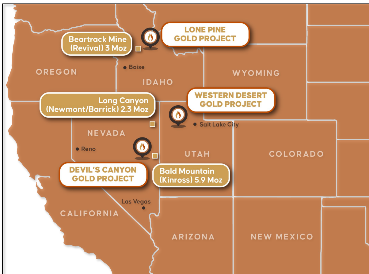
Figure 1 – Diablo Resources, United States of America (USA) project portfolio, located in the mining friendly states of Utah, Nevada and Idaho.

All three project areas have mineralisation at surface that require further exploration. Some prospect areas within the project areas appear to have only been lightly drilled or never been drill tested and present as priority targets.