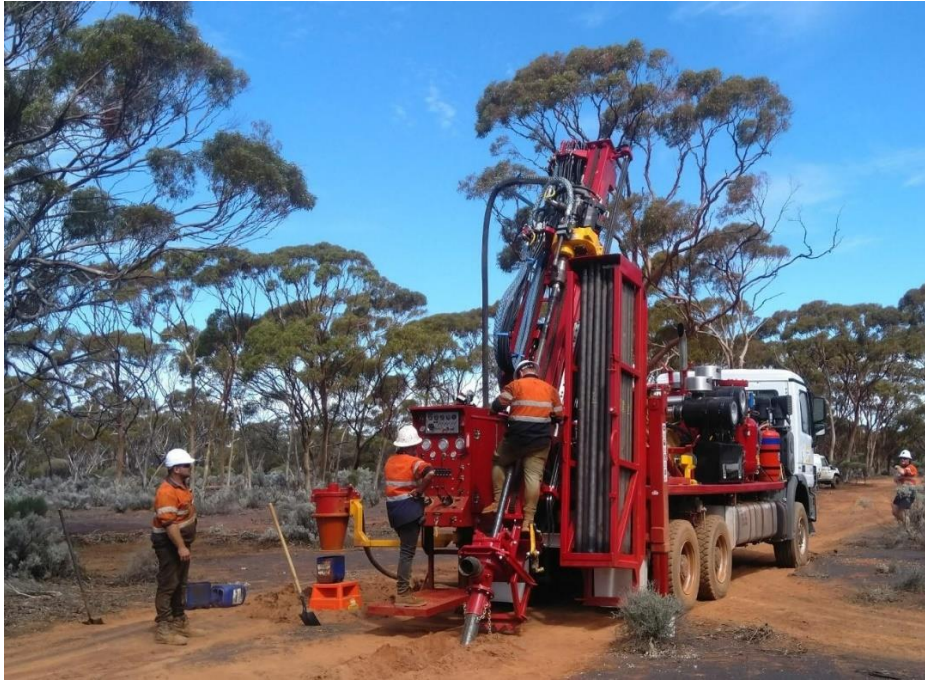
Figure 1, Prospect drilling onsite at Ora Banda South Gold Project