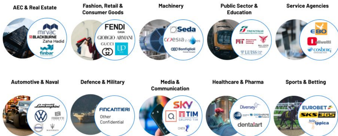
Figure 3: Customer Portfolio (selection)

The Company looks forward to updating the market on further TCV developments as they materialise.