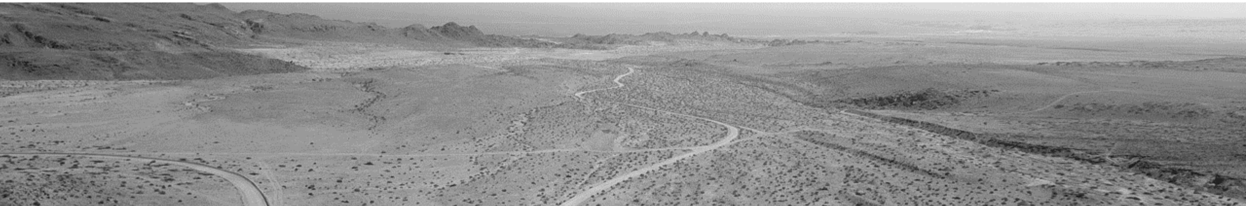
El Zorro access road looking west to Pacific Ocean & Pan American Hwy

Tesoro aims to become a low cost gold producer in Chile