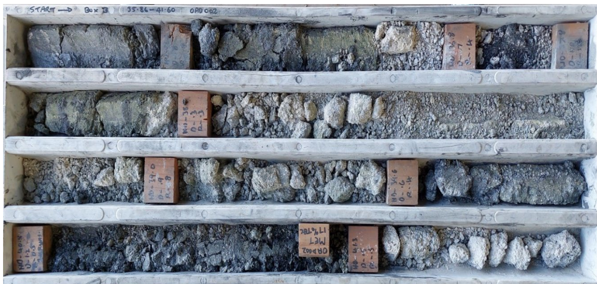
Figure 3: Remaining core from OAD002, (containing 1.7m @ 16.65% TGC from 39.60m), prior to resampling for the revised testwork to feed into the updated scoping study 10