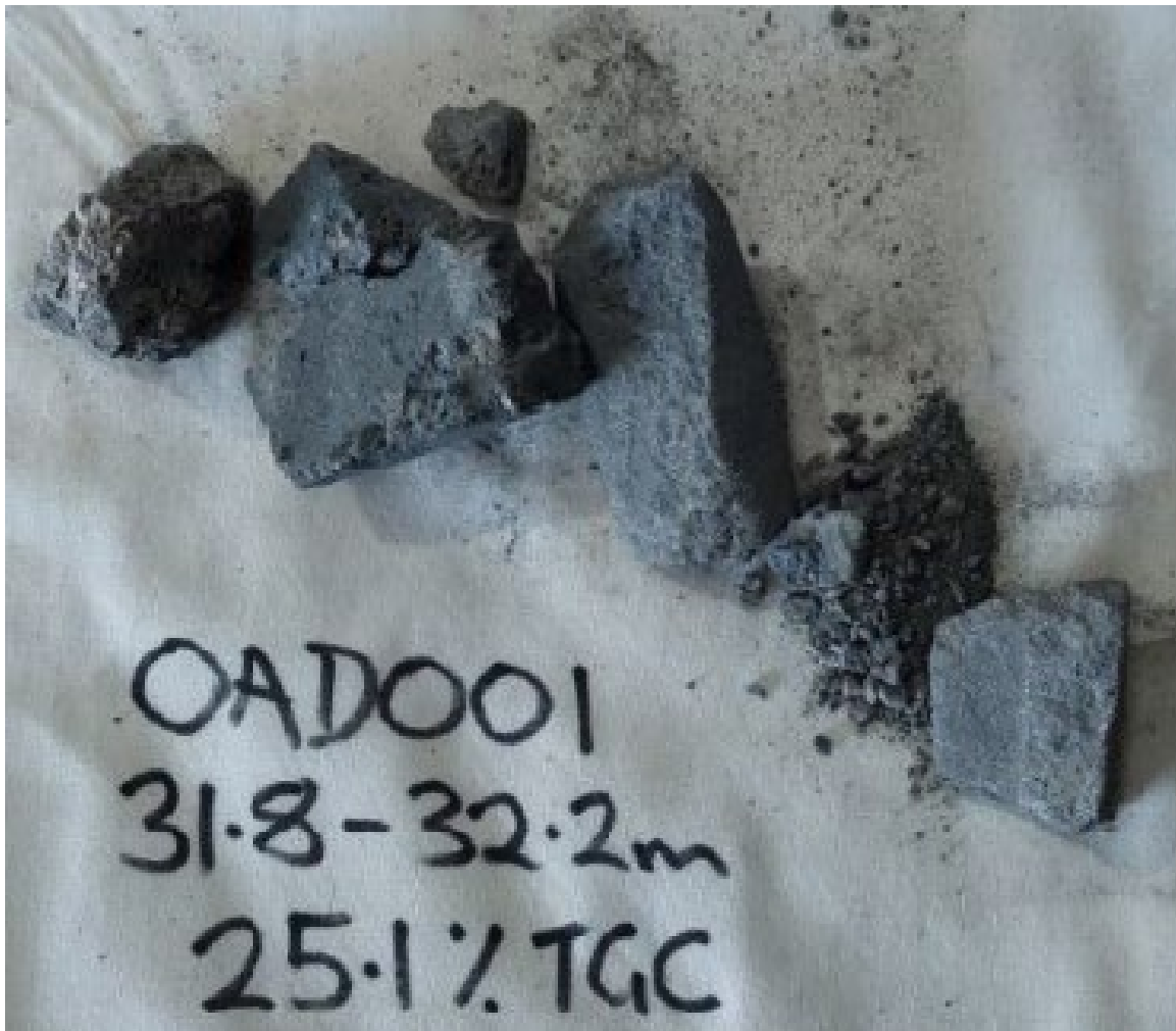
Figure 2: High-grade diamond drill core fragments from OAD001 - resampled for revised testwork 9