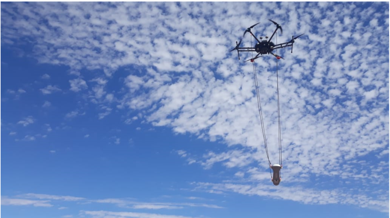
Figure 1: The AeroPhysX UAV airborne magnetic survey system.

The airborne magnetic survey will be conducted by AeroPhysX, which the Company believes to be a world leader in UAV exploration systems, having extensive experience operating throughout Africa and internationally.